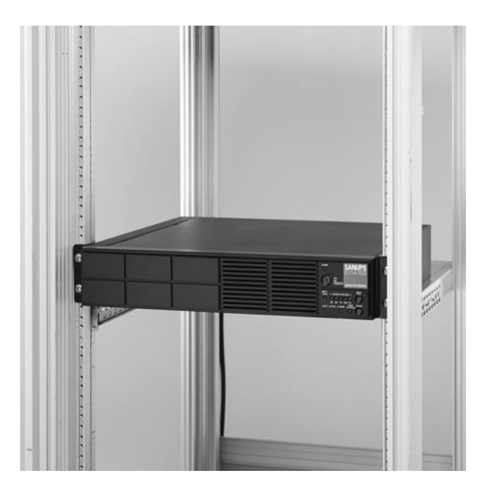
Fig. 4 Mounted on 19-inch rack