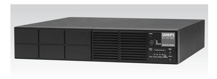
Fig. 1 "SANUPS E11A"