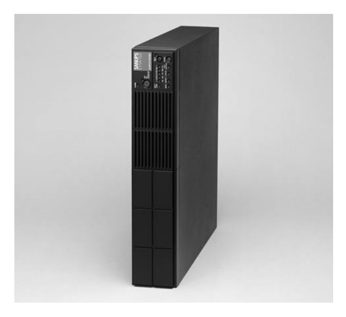
Fig. 5 Placed vertically on floor

Note: Stabilizer to prevent toppling included.